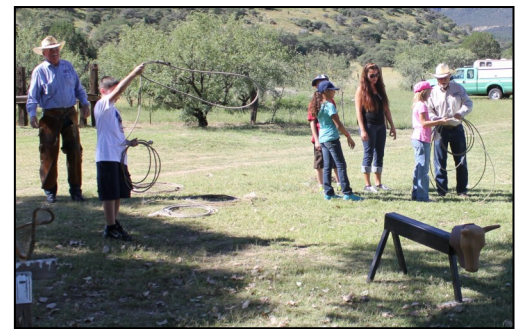
COWBOY-WESTERN ROPING SKILLS