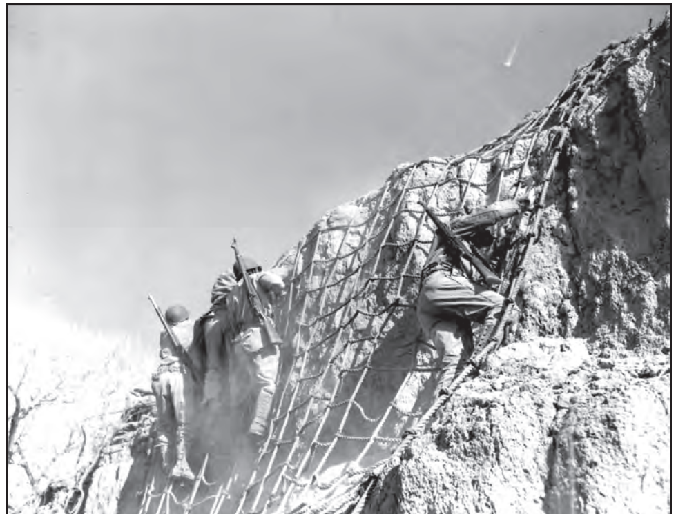
Soldiers from Fort Huachuca assault the ghost town of Charleston, Arizona, by scaling cargo nets. Date unknown.

After World War II ended, the lease with Boquillas was terminated in July 1946, and the State of Arizona lease was terminated in June 1947; however, munitions from the military training remained. In 1951, the Army moved back into the fort, however, there is no indication that the Boquillas land was reacquired when the fort reopened.