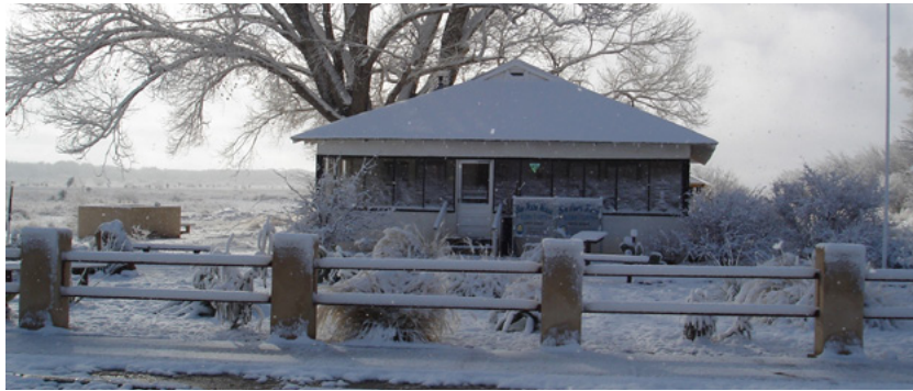
San Pedro House in winter.