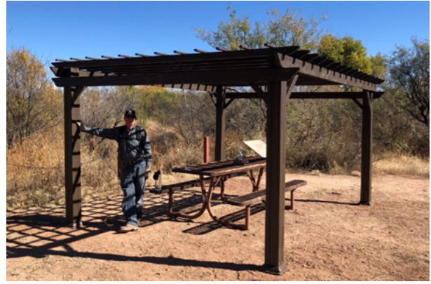
(Left) Murray Springs volunteers on National Public Lands Day. (Right) The finished ramada.