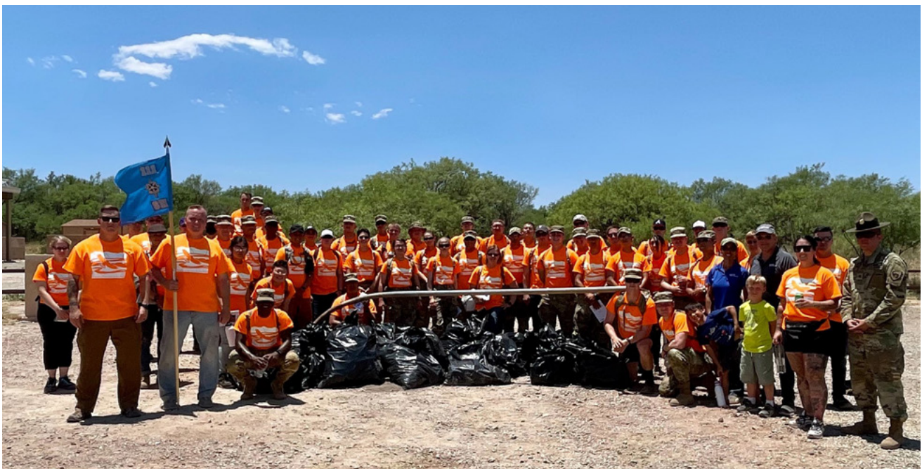
Soldiers from Fort Huachuca, following their June 13 cleanup day at San Pedro House and Charleston Road Bridge.

Well, at the risk of gushing, this was a special day for us. The soldiers in this group are at Fort Huachuca for training. They are far from home, often without transportation to leave post very often. We hope they enjoyed their day at the river, even if we put them to work.