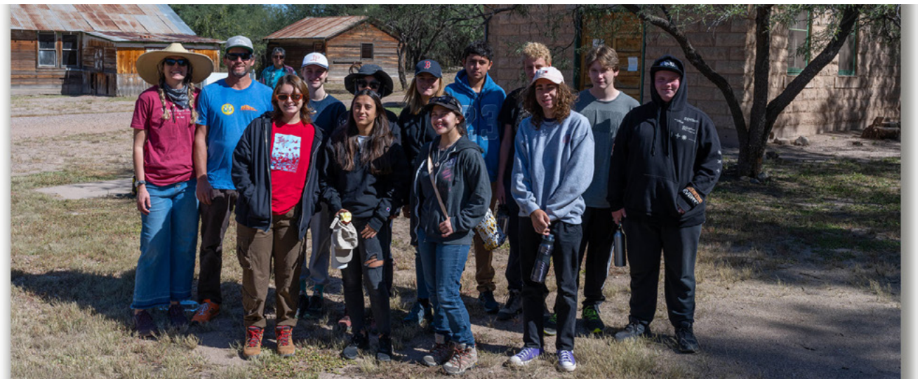
Verde Valley visitors.