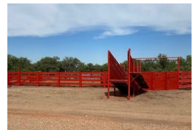
Looking good!!

At the end of the day efforts from all these people enabled this effort to help preserve a cultural treasure of the SPRNCA. Southwest Gas employees volunteered their time and the company provided equipment and funds for the paint and supplies.