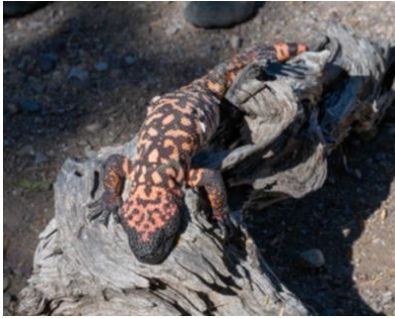
Monster of the Gila