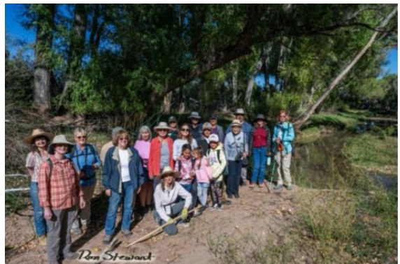
Nature Walk, part of our Annual Meeting at the Gray Hawk Ranch