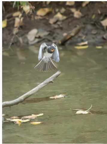
Open Wide! Sheila Foraker - Honorable Mention