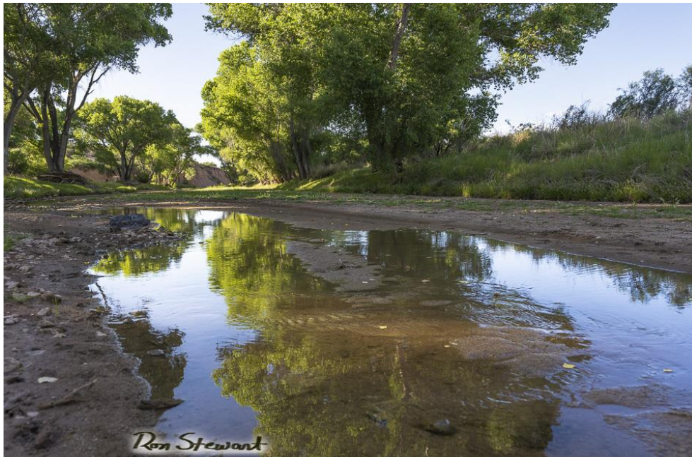
The San Pedro River near Fairbank, June 3rd, 2023

In this issue: President's Report, Time Marches On, FSPR Annual Membership Meeting, Check Out the Good Reads at the Nature Store, San Pedro House Xeriscape Garden Education Outreach, San Pedro House Gardens Workday, November 8th, 2023, Tucson Mission Gardens Volunteers Visit the SPRNCA, National Public Lands Day Project in the SPRNCA, FSPR Photo Contest, FSPR Members, FSPR Board of Directors and Staff List