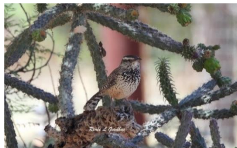
Cactus Wren - Our State Bird, Renee Goodhue - Honorable Mention