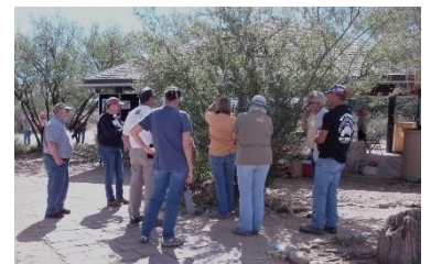
Pruning demonstration at xeriscape garden.

the Friends Board on our first adult educational outreach class post-pandemic.