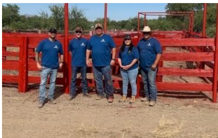
Southwest Gas Volunteers

The 2023 SPRNCA National Public Lands Day was held October 21 at the Little Boquillas corrals. The goal was to clear vegetation around the historic structure and then apply paint to preserve the wooden rails.