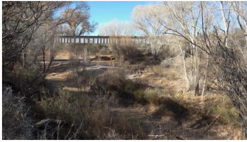
Abandoned RR Bridge Near Fairbank, Clyde Raines – Honorable Mention